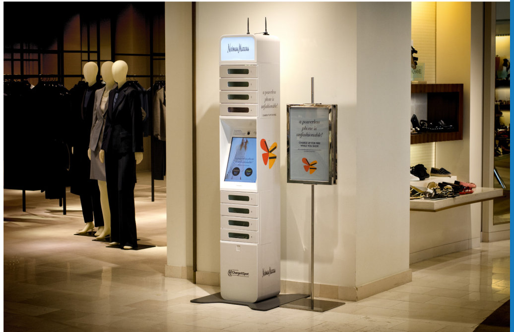
Figure 2. ChargelSpot - Neiman Marcus - San Francisco, CA

“ Bergdorf Goodman has always adopted a forward-thinking approach to fashion, and now we're looking to cutting-edge retail technology, like ChargelSpot, to help enhance our customer service and set the gold standard for exceptional retail experiences. ”